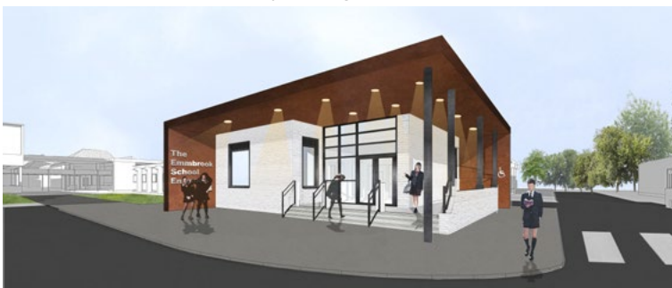
2. New Admin/Welcome Entrance to the Main School

Wednesday 7th December 2022 at 6.30pm-8.00pm