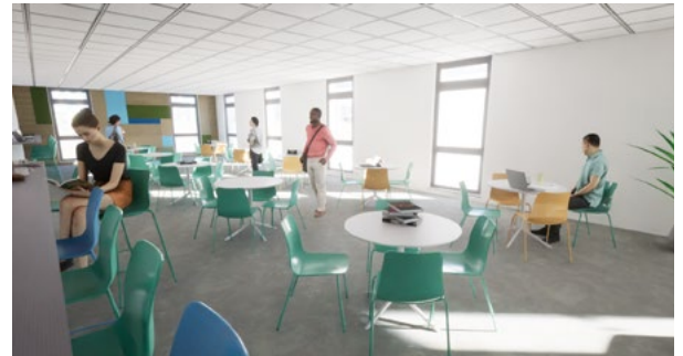
1. New 6th Form Social and Study Building

Wokingham Borough Council is working with a number of schools, including the Emmbrook School, to provide additional school places, to address the shortfall in secondary Year 7 places.