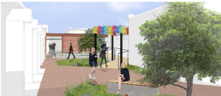
3. Reconfiguration of existing walkway and courtyard.