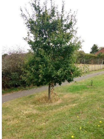
Jubilee Oak #10 Planted 4.12. 2012