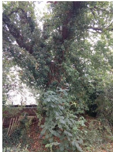
English Oak #701 – WDVTA