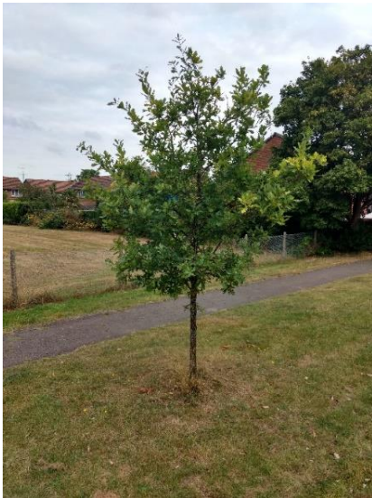
Jubilee Oak #9 Planted 4.12.2012