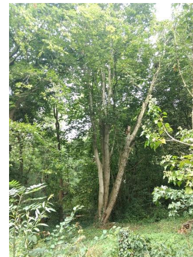
Horse Chestnut (multi-stemmed) #1185 - WDVTA