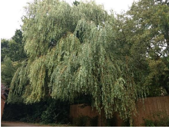
Golden Weeping Willow