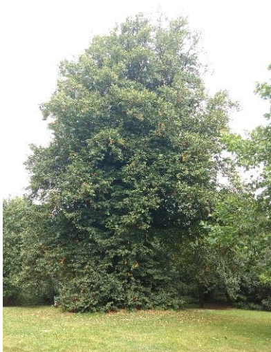
Common (hybrid) Lime #3386 - WDVTA