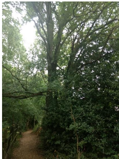
Field Maple (coppiced) #3387 - WDVTA