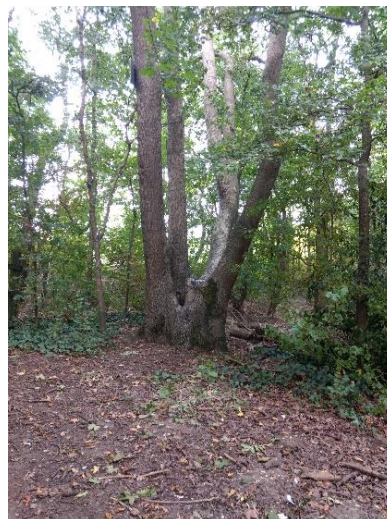
Ash (coppiced) #7914 - WDVTA