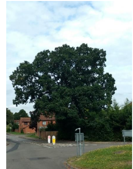
English Oak #1665 - WDVTA