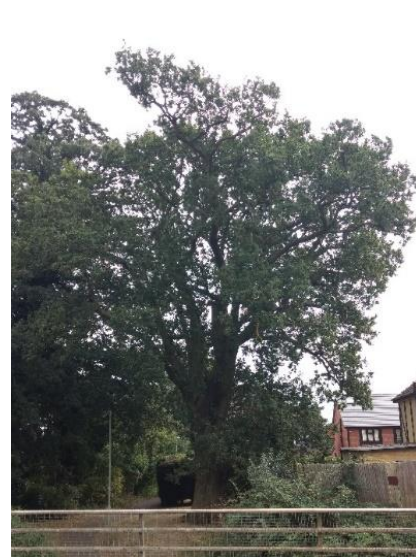
English Oak #1664 - WDVTA