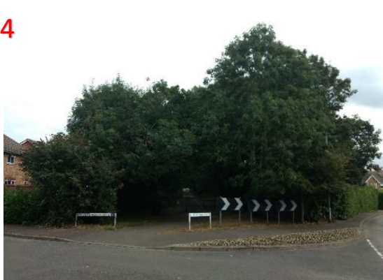
Ash (pollarded) #7614 - WDVTA