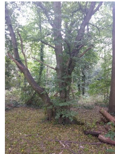
Hornbeam (coppiced) #7915 - WDVTA