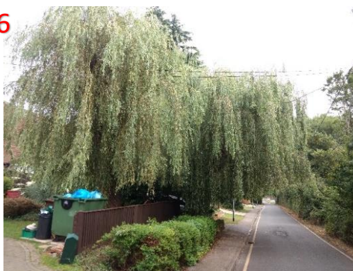
Golden Weeping Willow