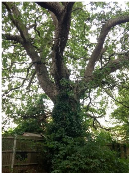
English Oak #2945 - WDVTA