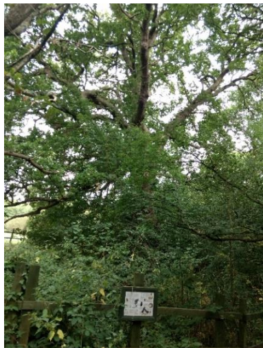
English Oak – known as the 'Gemini' Oak. #2814 - WDVTA