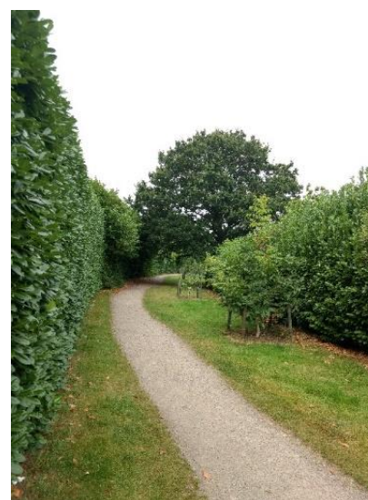
Community Orchard Planted 13.2.2016