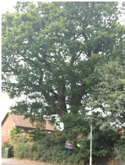
English Oak #2948 - WDVTA